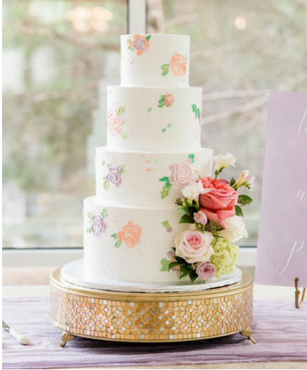
4-TIER WEDDING CAKE

Your first option is a 4-tiered buttercream wedding cake. This is a classic and timeless way to serve each guest a slice of cake, while also having the opportunity to preserve your top tier of cake. We provide boxes for your topper and leftover servings.